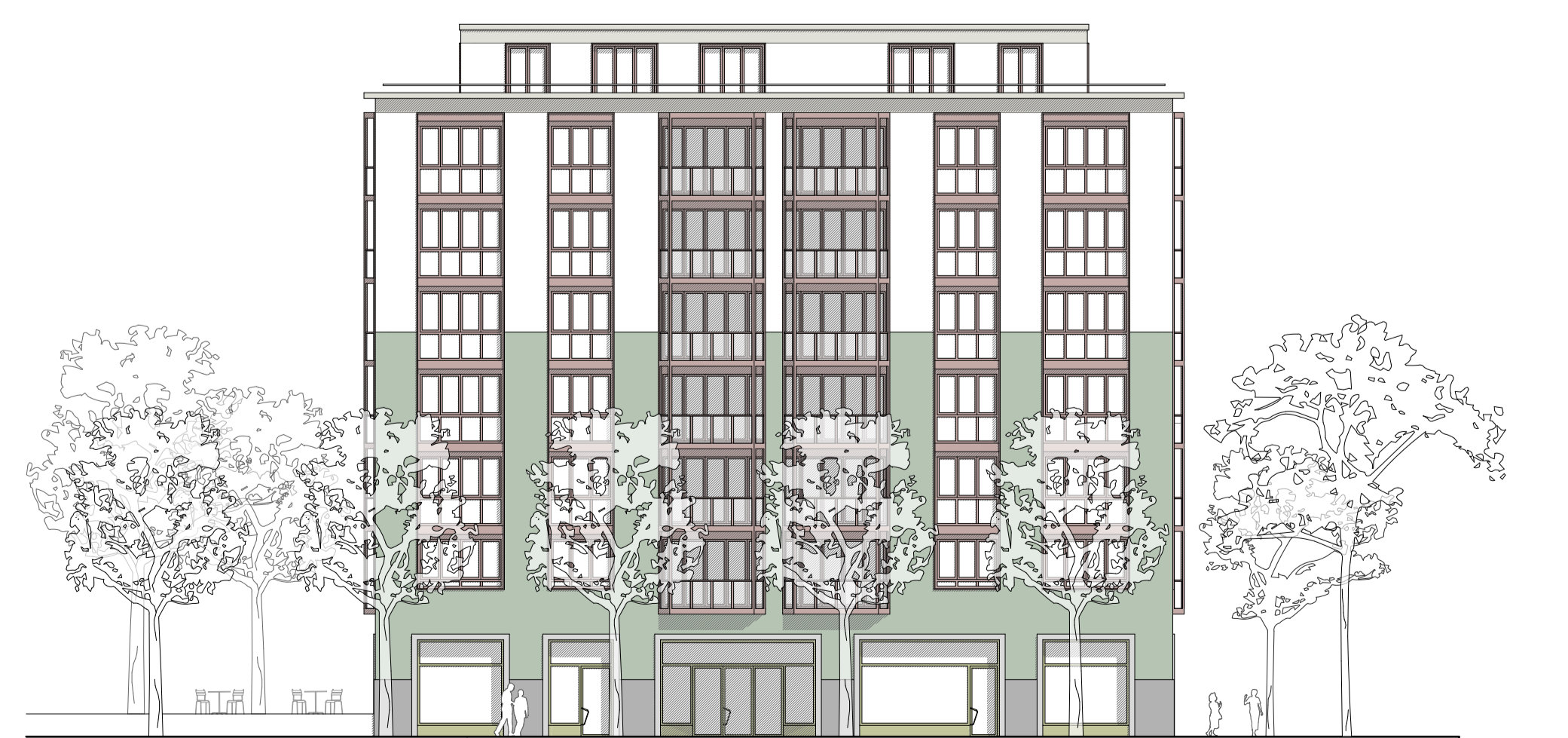
Ansicht Buonaserastrasse 1/200