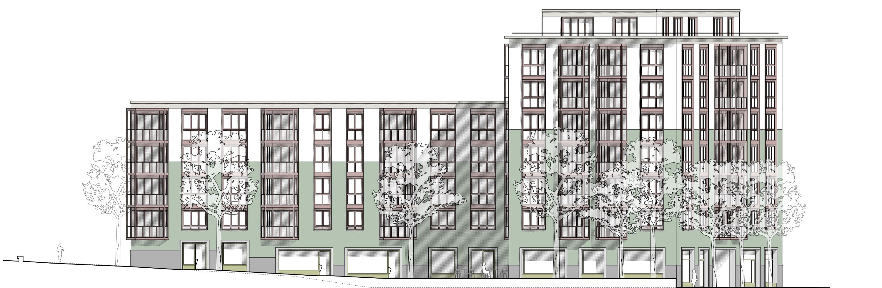
Ansicht Hof 1/200