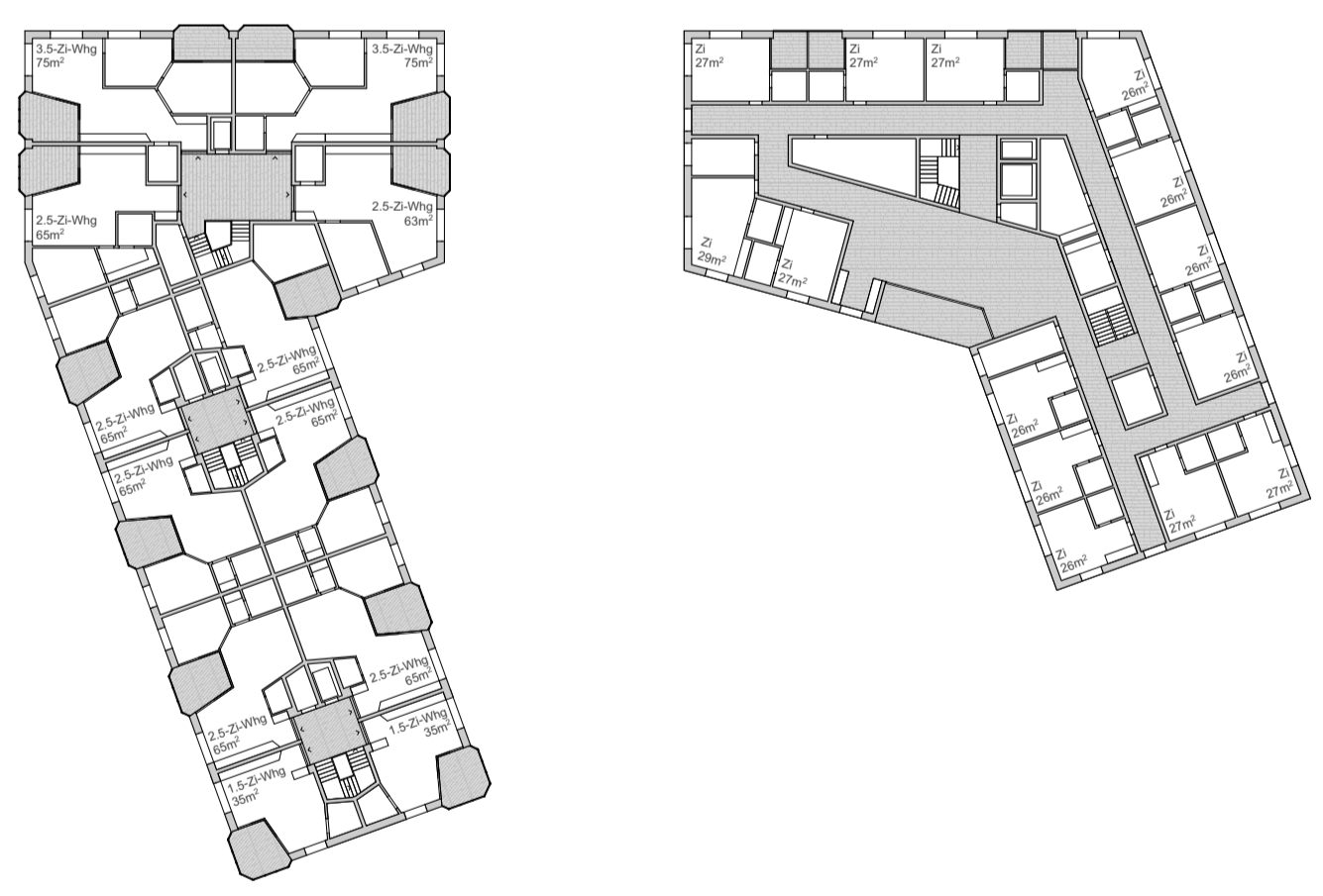
Regelgeschoss 1/500 0 10 20 m